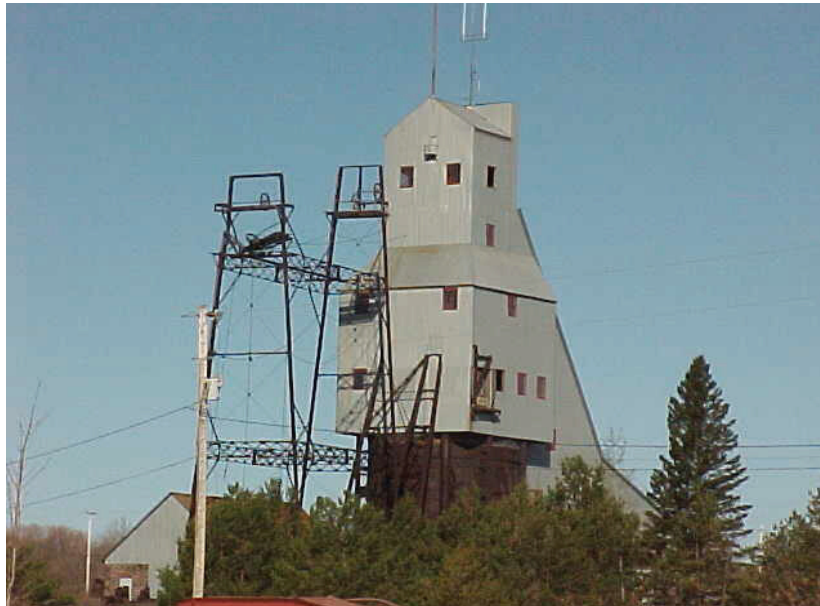
Mine shaft house, Quincy Copper Mine, Hancock, Michigan

Instruction in the geophysical development and use of magnetic field maps is needed.